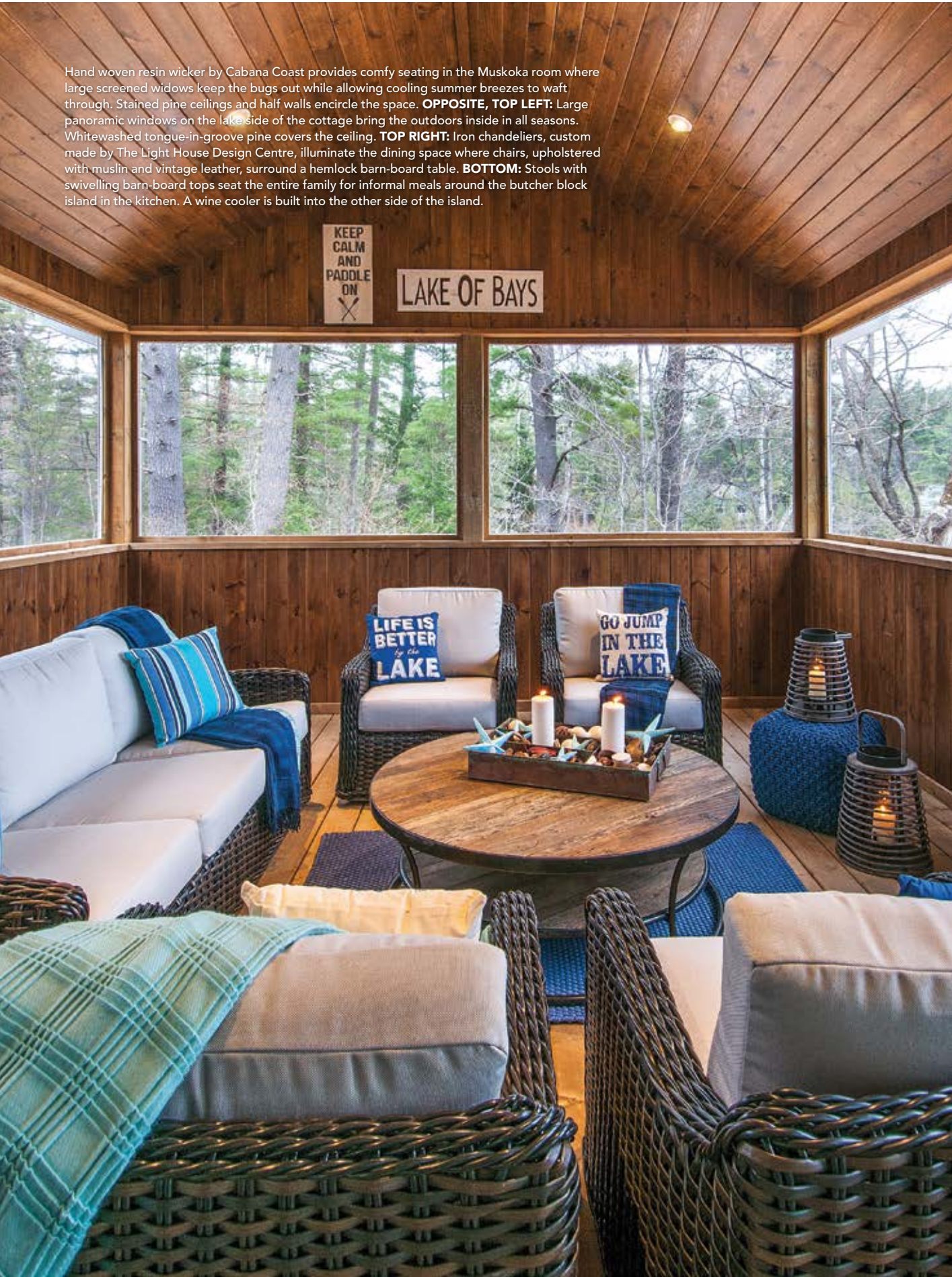
Hand woven resin wicker by Cabana Coast provides comfy seating in the Muskoka room where large screened widows keep the bugs out while allowing cooling summer breezes to waft through. Stained pine ceilings and half walls encircle the space. OPPOSITE, TOP LEFT: Large panoramic windows on the lake side of the cottage bring the outdoors inside in all seasons. Whitewashed tongue-in-groove pine covers the ceiling. TOP RIGHT: Iron chandeliers, custom made by The Light House Design Centre, illuminate the dining space where chairs, upholstered with muslin and vintage leather, surround a hemlock barn-board table. BOTTOM: Stools with swivelling barn-board tops seat the entire family for informal meals around the butcher block island in the kitchen. A wine cooler is built into the other side of the island.