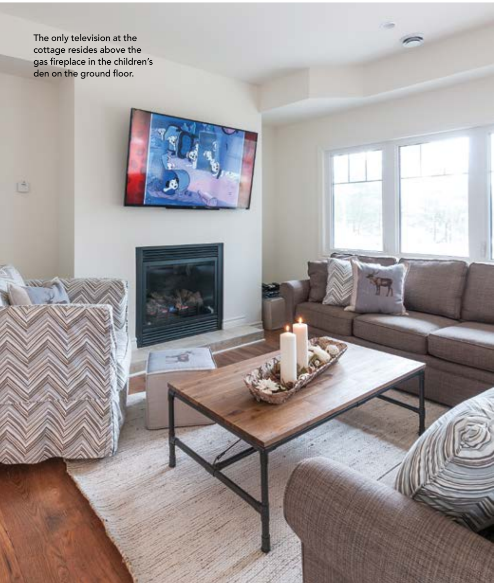
The only television at the cottage resides above the gas fireplace in the children's den on the ground floor.