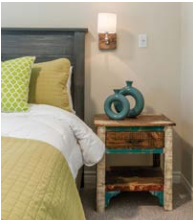
TOP: Queen-over-queen pine bunk beds, trimmed with a moose crossing theme, furnish James's bedroom with enough sleeping space for an entire family. MIDDLE: White double bunkbeds, custom made to sleep six, complement the coastal look of the girls' bedroom. ABOVE: Guest rooms, upstairs and downstairs, offer quiet privacy.